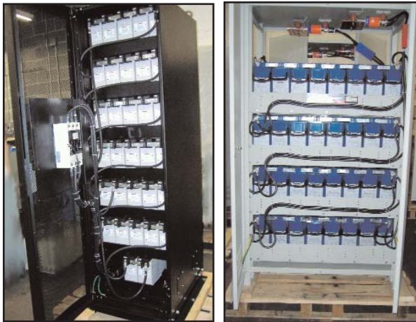
Figure 3. 10 year front access batteries in cabinets

additions. This eliminates the need for working space between the top of the battery and the shelf above, which in most cases is a foot or more. The clearance requirement between the top of the battery and the shelf above is even further minimized in the front access VRLA battery. Figures 2 and 3 are photographic examples of typical cabinet arrangements for both the top and front access type VRLA batteries which illustrate this point.