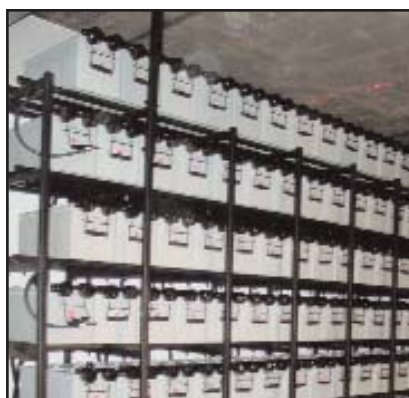
Figure 4. Custom installation possible with 10-year FT VRLA

Presently, VRLA batteries are manufactured in ampere-hour sizes ranging from a few Ah up to several thousand Ah. The smaller Ah cells are generally packaged in monoblocs of three or six cells (i.e. 6 or 12 V units). These batteries are generally constructed with thinner plates, smaller terminals and through-the-wall inter-cell connections. This