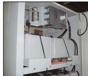
Figure 2. Close-up of 10 year top terminal battery installed in cabinet

The maturation of the VRLA product and development of larger monoblock sizes, resulted in significant advantages that ensue from the limited and immobilized electrolyte in the VRLA design. The fact that electrolyte level does not have to be maintained in the VRLA cell eliminates the routine maintenance of checking the electrolyte level and making periodic water